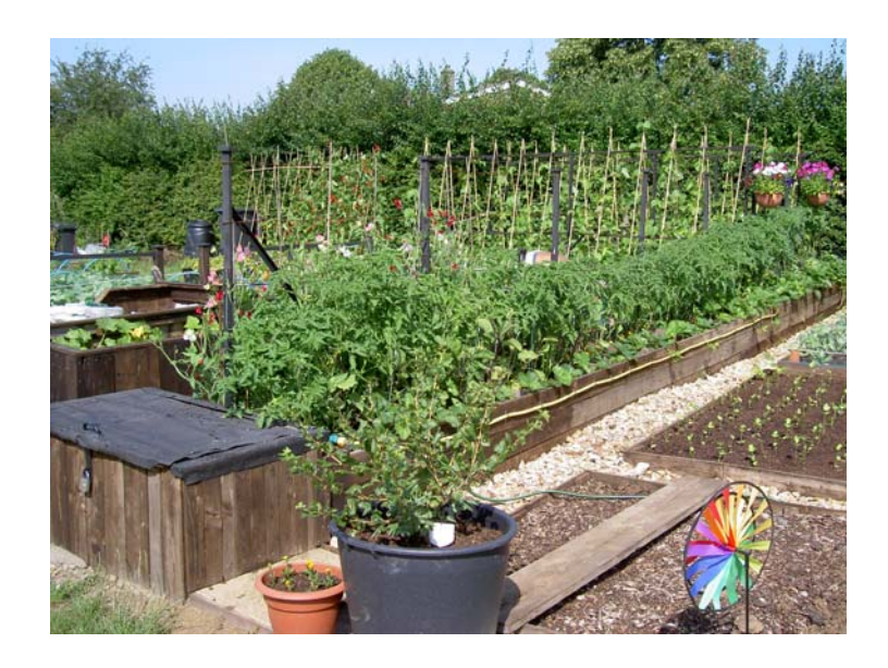
Objective 7: Allotments