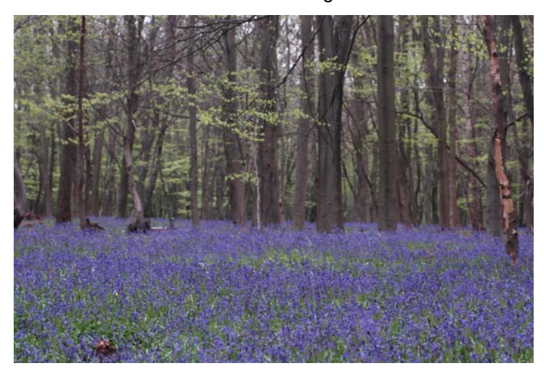
Objective 4: Wildlife Conservation

The Government have recently introduced a new National Indicator (NI197) to measure the performance of local authorities for biodiversity by assessing the implementation of active conservation management of Local Sites.